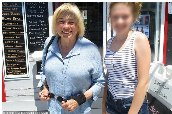
“Maine Gov. Janet Mills (left) was photographed at an ice cream shop in Stonington, Maine, without a mandated face mask” https://www.dailymail.co.uk/news/article-8461083/Maine-governor-Janet-Mills-criticized-arriving-mask-ice-cream-shop.html

The science is clear that masks don’t work and actually increase infection. Everyone is angry at politicians being caught without masks but force them on the public. Dr. Fauci, Governor Newsom (who is being recalled) and Governor Mills are included in this criticism which gives citizens doubt over their effectiveness. We implore you to lift the mask mandate and protect people with disabilities who are being illegally harassed and refused service . Everyone’s has the right under the Constitution to the integrity of their bodies and right of free exercise.