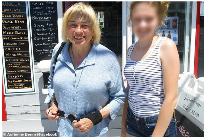
“Maine Gov. Janet Mills (left) was photographed at an ice cream shop in Stonington, Maine, without a mandated face mask” https://www.dailymail.co.uk/news/article-8461083/Maine-governor-Janet-Mills-criticized-arriving-mask-ice-cream-shop.html

citizens doubt over their effectiveness. We implore you to lift the mask mandate and protect people with disabilities who are being illegally harassed and refused service . Everyone's has the right under the Constitution to the integrity of their bodies and right of free exercise.