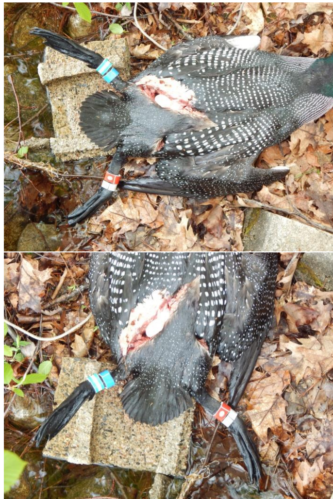
Figure 1. Lacerations across the back of the adult male loon, found dead adjacent to the racecourse on Watchic Lake in May 2018, are consistent with having been struck with the propeller from a high speed, racing watercraft.

While loons are not listed as threatened or endangered in Maine, they are listed as a species of Greatest Conservation Need in the state's most recent Wildlife Action Plan and they are an iconic part of Maine's tourist industry, drawing people to visit and stay on Maine's lakes and ponds each summer. While populations have grown over the last several decades, breeding loons have never increased chick production in that time. Because loons take up to a decade to successfully breed, the loss of a breeding adult on a lake like Watchic Pond, which is ideally suited for loon nesting, may be felt for many years to come.