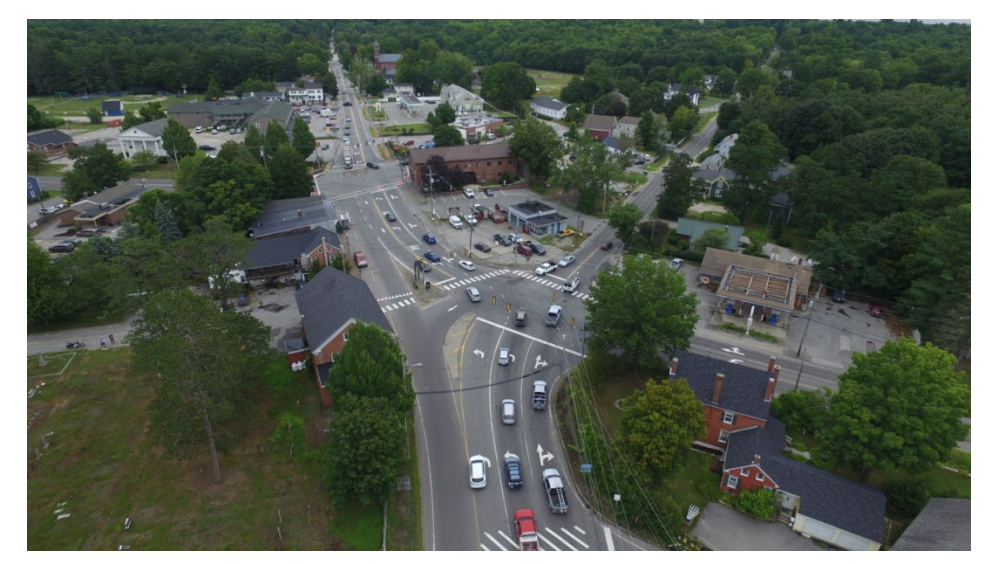
Figure 1: Gray Village, July 2022

Note the wide lanes and turning angles that make crossing the street dangerous for walkers and bikers. They also allow vehicles to move through the village at high speed.