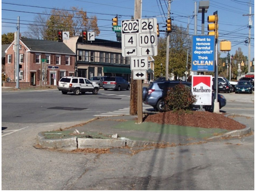
Figure 5: A wholly inadequate ramp and crosswalk on the corner of Main St. and Yarmouth Rd.

Another ridiculous short section of sidewalk on Main Street that meets the letter of the law (ramps down to crosswalks) but is difficult and unsafe to use, especially for someone in a wheelchair, pushing a stroller, or trying to navigate the intersection with small children. Note that the ramp essentially dumps walkers onto the street before they can even access the crosswalk.