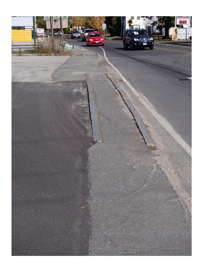
Figure 6: Current sidewalks on Main St. in Gray discourage use by walkers and bikers and offer little safety.

This very narrow section of sidewalk on Main Street is unsafe and unattractive; really little more than an afterthought. It is almost lost in vast curb cuts. It is right on the street with very little buffer from cars racing through the intersections at speeds up to 40-50mph.