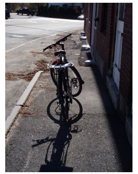
Figure 3: Poor sidewalk design discourages walkability.

This inadequate sidewalk on Main Street narrows down to nothing by the end of the building. At that point bikers and pedestrians must compete with traffic rushing to the turnpike interchanges a short way ahead.