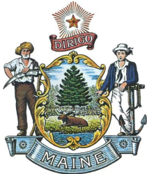
Janet T. Mills Governor