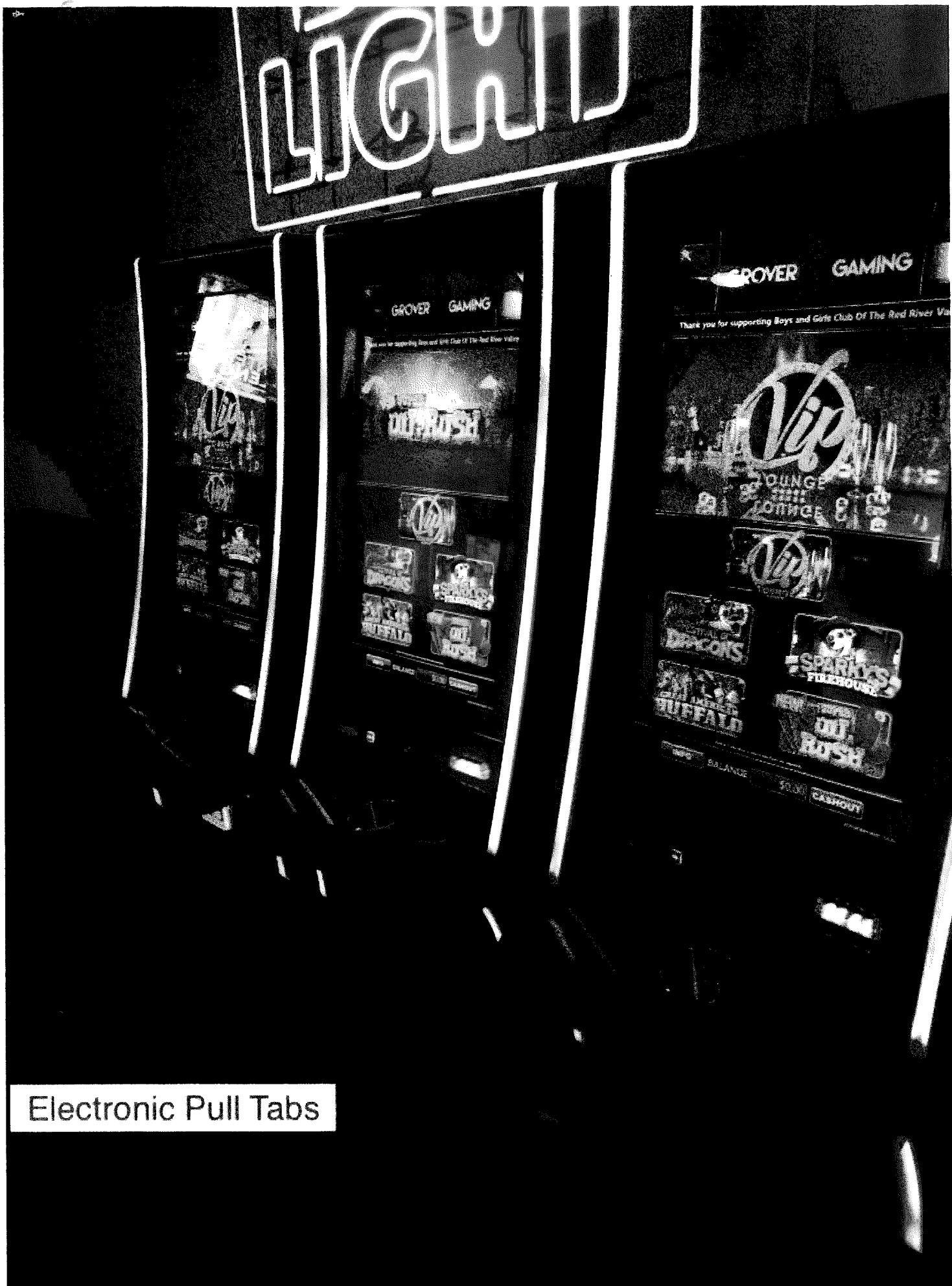
Electronic Pull Tabs