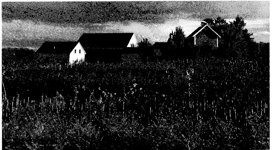
Bumblers Organic Farm in Windham, ME