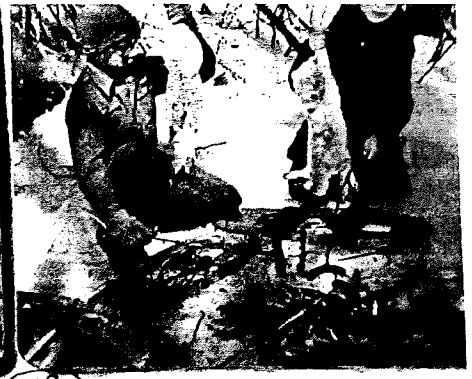
5 + BUNNIES BONNIE