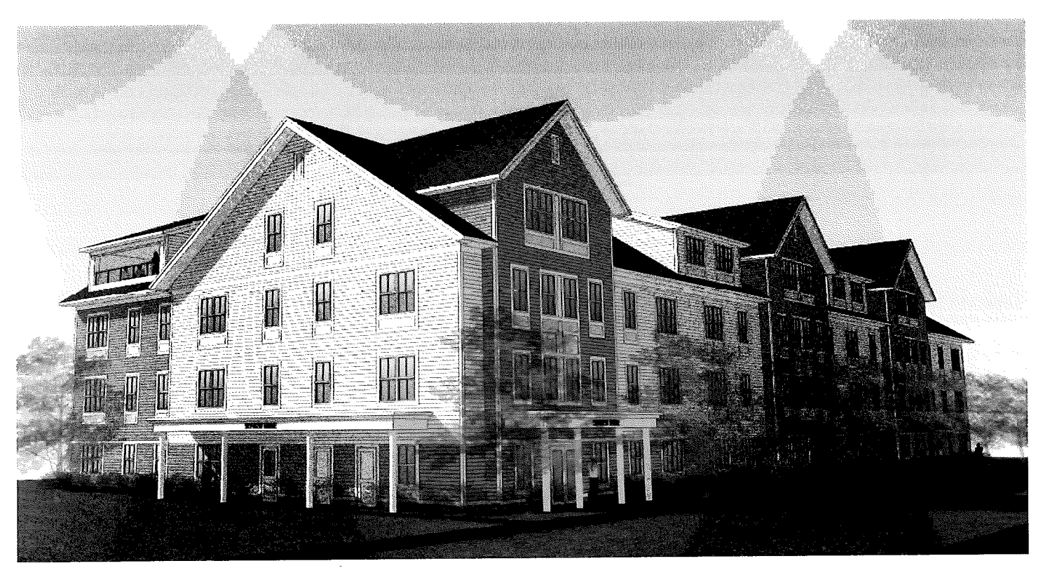
White Rock Terrace, Cumberland

We (and other developers) have more projects like this in the pipeline, just waiting for funding. One of the projects we're working on is another 55-unit project in Cumberland, Maine for low-income seniors (pictured below). We've already secured local subdivision and site plan approval, have an investor interested, and the entire project team ready to go as soon as an available 4% Low-Income Housing Tax Credit with subsidy program opens at MaineHousing.