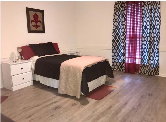
Typical bedroom for exiting incarcerated people housed by Louisiana Parole Project.