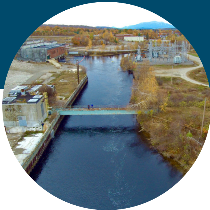
Modular RivGen Test Site

Development of the Modular RivGen system has been funded by the U.S. Department of Energy and utilizes ORPC's proven turbine generator unit technology.