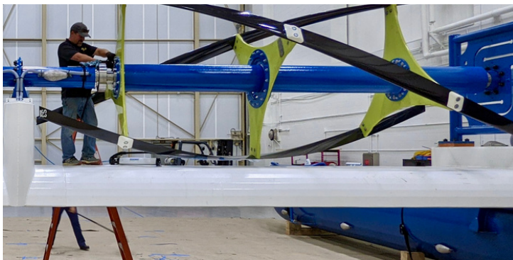
The Modular RivGen devices utilize ORPC's proven cross-flow turbine technology.

Ocean Renewable Power Company (ORPC), a developer of tidal and river power systems that generate electricity from free flowing tidal and river currents without dams, has partnered with Our Katahdin to test the new Modular RivGen power system in Millinocket, Maine.