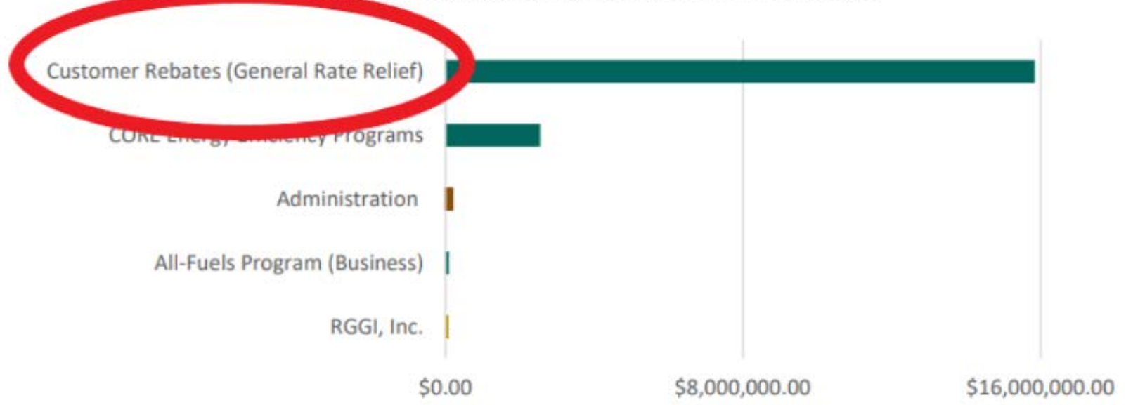
Chart 17: 2020 New Hampshire RGGI Investments by Recipient

New Hampshire RGGI investments represent $18.8M in 2020.