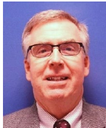
Director: Christopher W. Nolan