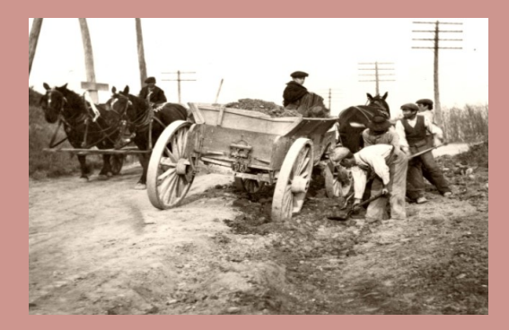
1915 Road repair, Rt 1

MARA is a domestic non-profit organization