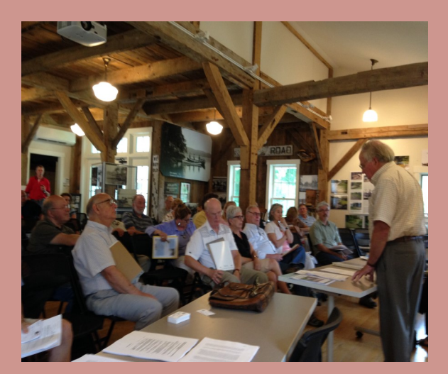
Attentive listeners at a MARA conference