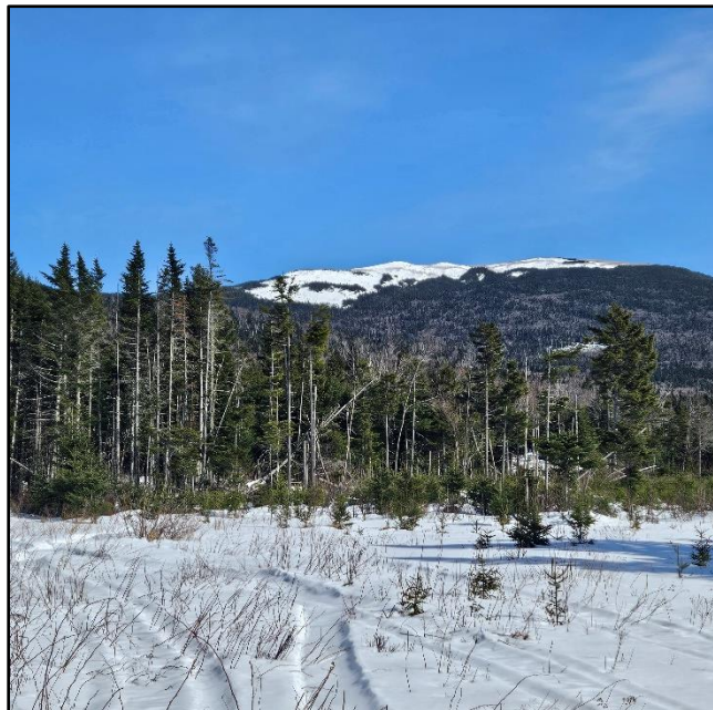
The south peak of Mt. Abraham, viewed from Perham Stream

MAINE DEPARTMENT OF AGRICULTURE, CONSERVATION AND FORESTRY Bureau of Parks and Lands March 1, 2026