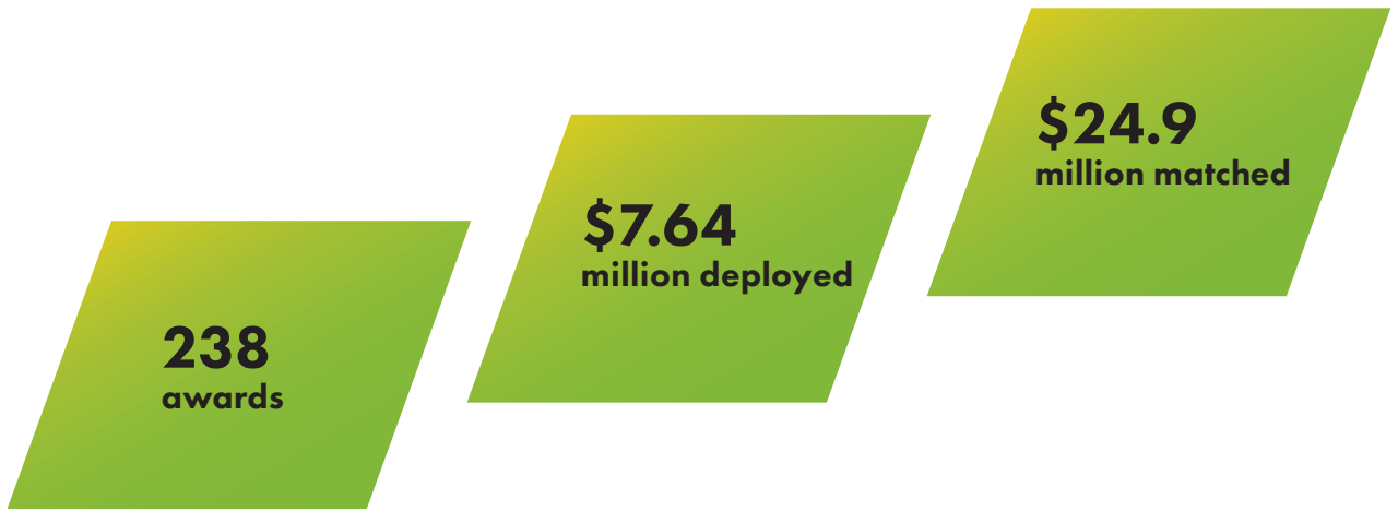
Total Dollars Awarded/Matched by Year

In FY24, MTI made 238 awards totaling $7.64 million. The organizations receiving those awards matched MTI's funding with $24.9 million.