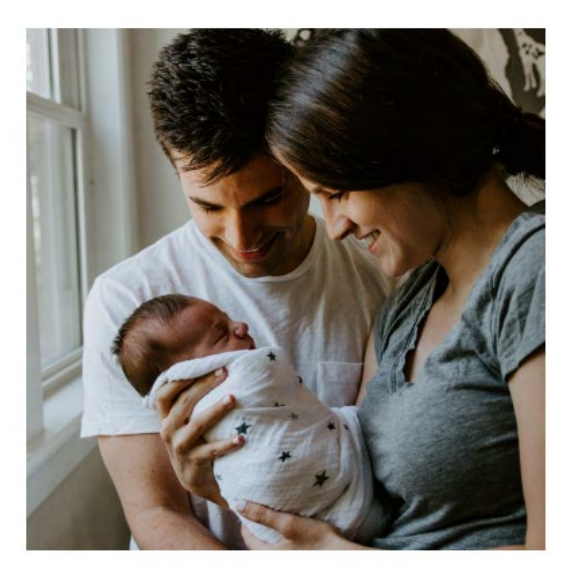
Maine Child Safety and Family Well-Being Plan

The Plan builds on collaboration across state agencies by the Maine Children's Cabinet and the State Agency Partnership for Prevention to improve and promote the healthy development of children and youth in Maine. There is particular focus in this work on