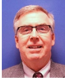
Director: Christopher W. Nolan