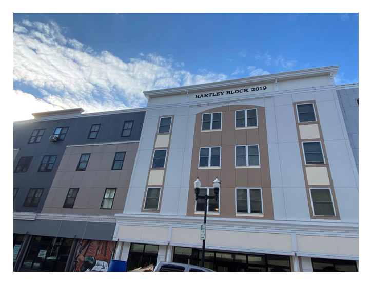
Hartley Block, a Low Income Housing Tax Credit property, opened in downtown Lewiston in May 2019. The development infilled a space left empty after a fire destroyed much of the block over a decade earlier.