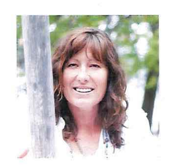
Commissioner Makin Dept of Education