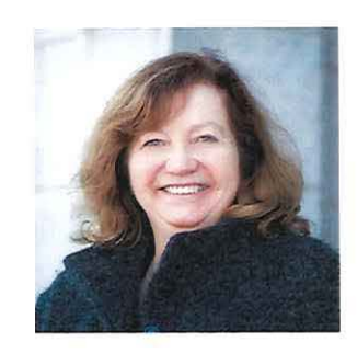
Commissioner Fortman Dept of Labor