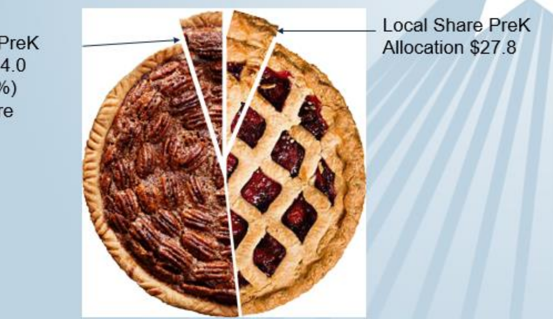
State Share PreK Allocation $34.0 Million (2.43%) Of State share